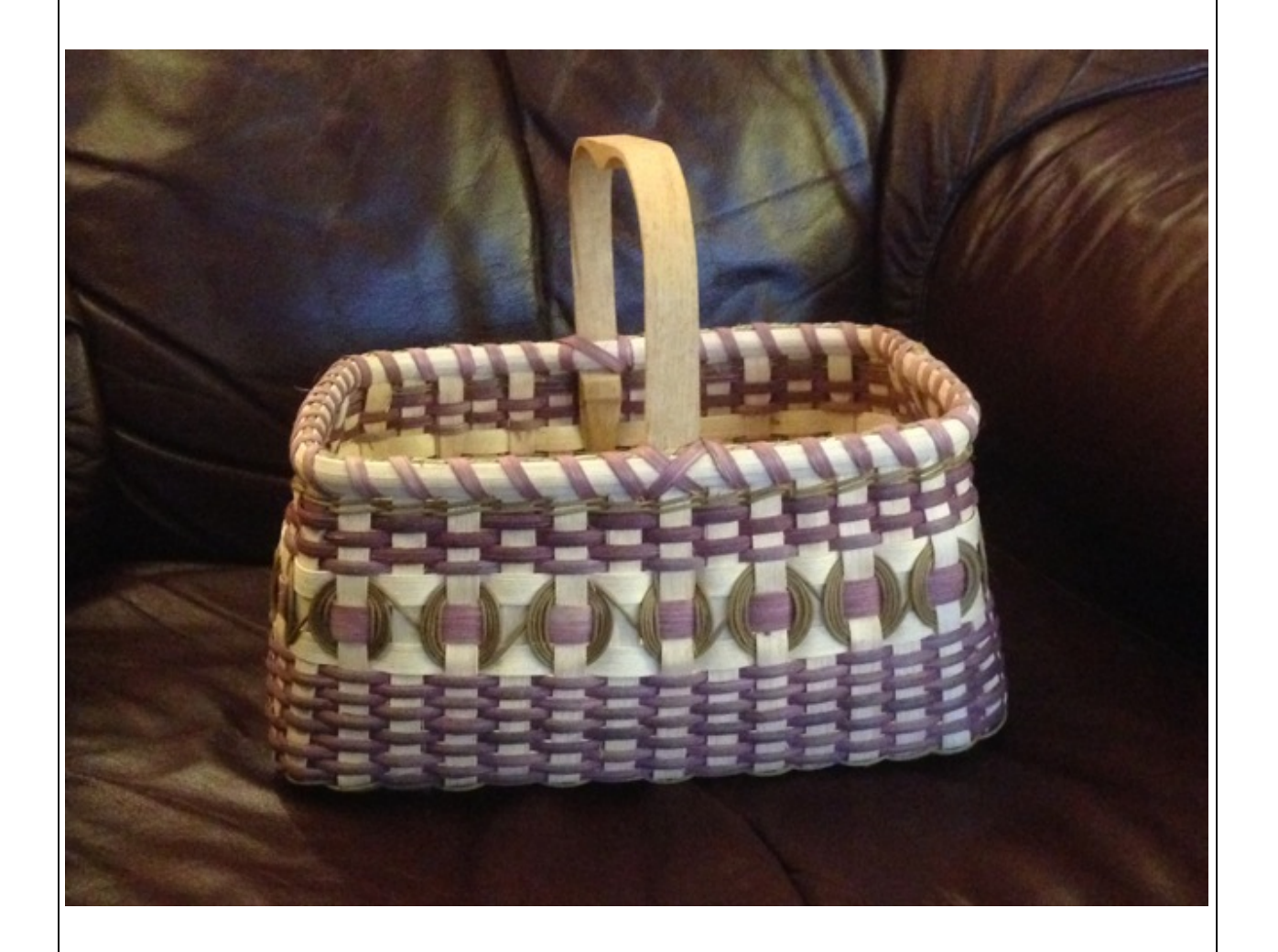
<u>First Basket:</u> Beth's Basket with Cherokee Wheels: <u>July 11<sup>th</sup> full day and July 12<sup>th</sup> AM.</u>

This 8 X 12" market basket is woven to 5 1/2" tall, using a combination of plain weave, twining, continuous weave, and the addition of beautiful Cherokee wheels. We will use flat and flat/oval dyed and plain reed, and add a notched wooden handle.