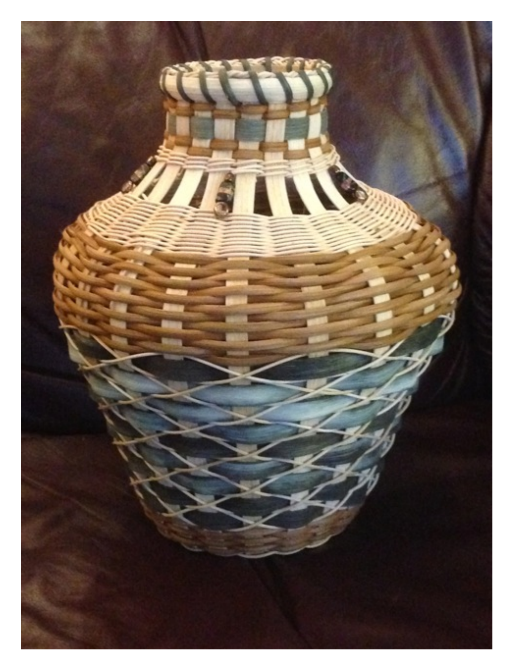
<u>Second Basket</u>: Genie Basket: July 13<sup>th</sup> full day and July 14<sup>th</sup> AM.

This basket starts with a T-pin start and twines to a 6" base, then gradually swells to about 10" across before it shrinks to its' 4" neck at 12" tall. This basket's main goal is to teach shaping, and the beautiful Japanese wave weave, seen in the "X" pattern over the wider flat reed.